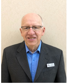
Glenn McMullen Foundation Chairperson