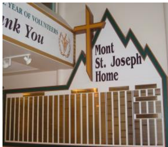
Donor Board near chapel in Mont St. Joseph Home